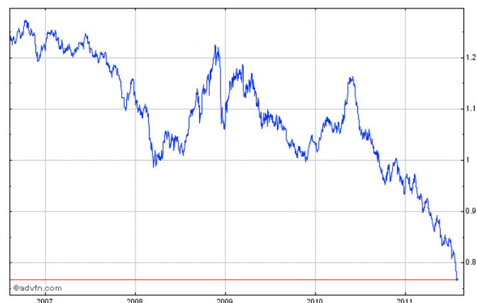
US Dollar vs Swiss Franc Devisen Chart

"We need something more than a wishful-thinking wand. Perhaps it's not so bad though: Congress didn't remove any loopholes, so there will be plenty of jobs for tax accountants.